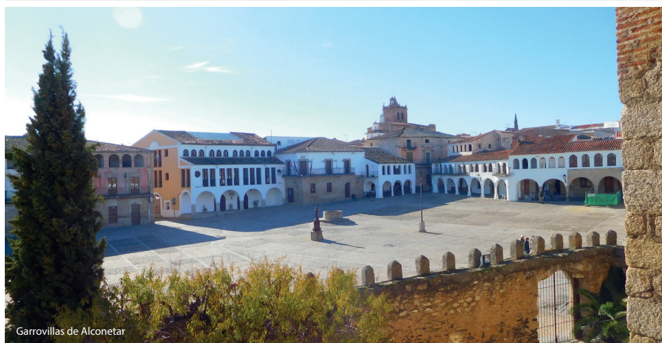
Garrovillas de Alconetar