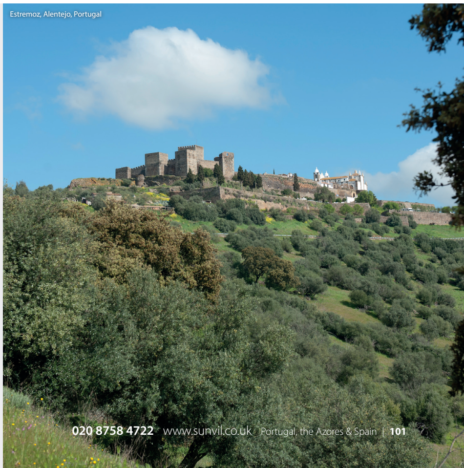
Estremoz, Alentejo, Portugal